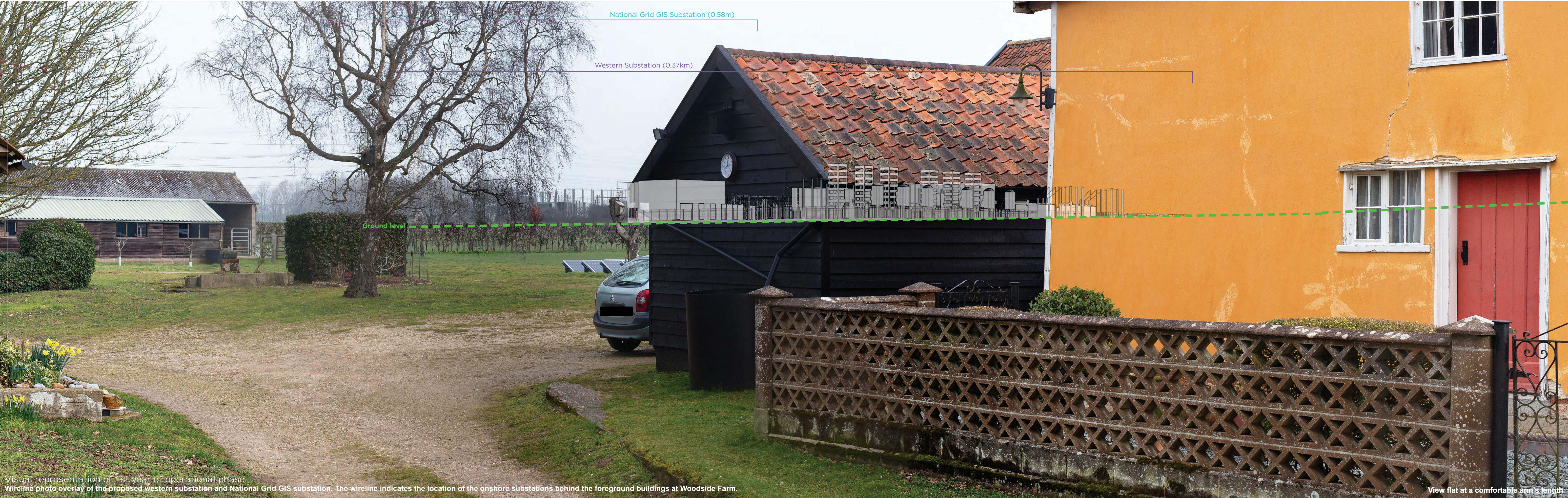
Visual representation of 1st year of operational phase Wireline photo overlay of the proposed western substation and National Grid GIS substation. The wireline indicates the location of the onshore substations behind the foreground buildings at Woodside Farm.