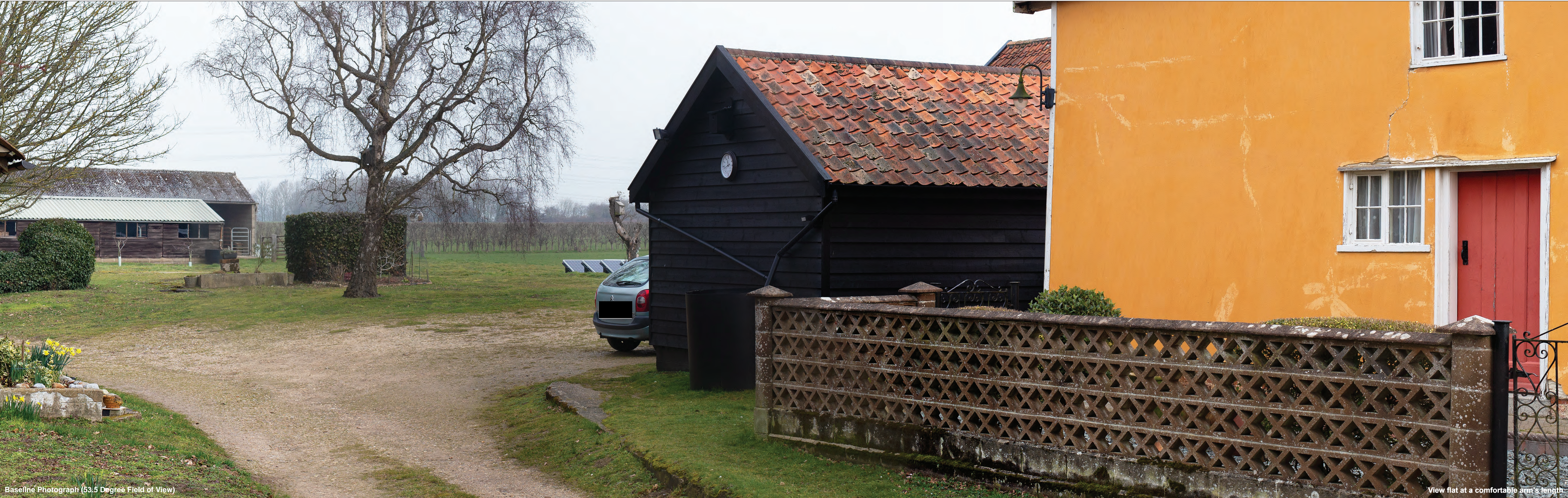
Baseline Photograph (53.5 Degree Field of View)