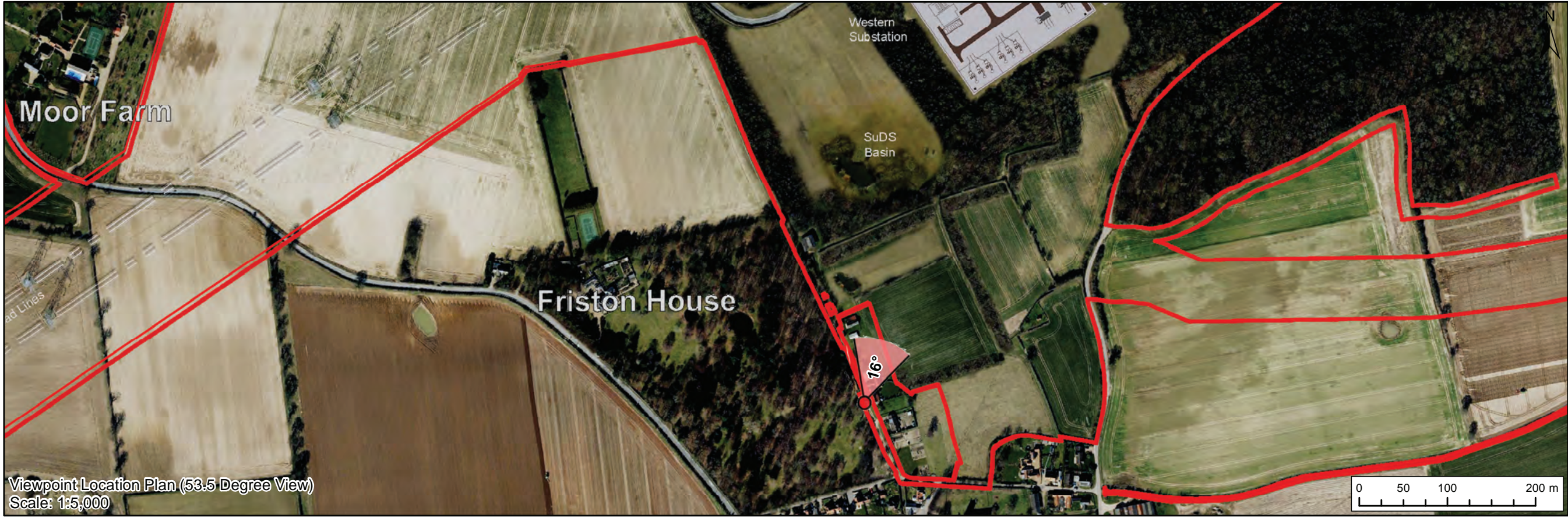
Viewpoint Location Plan (53.5 Degree View) Scale: 1:5,000